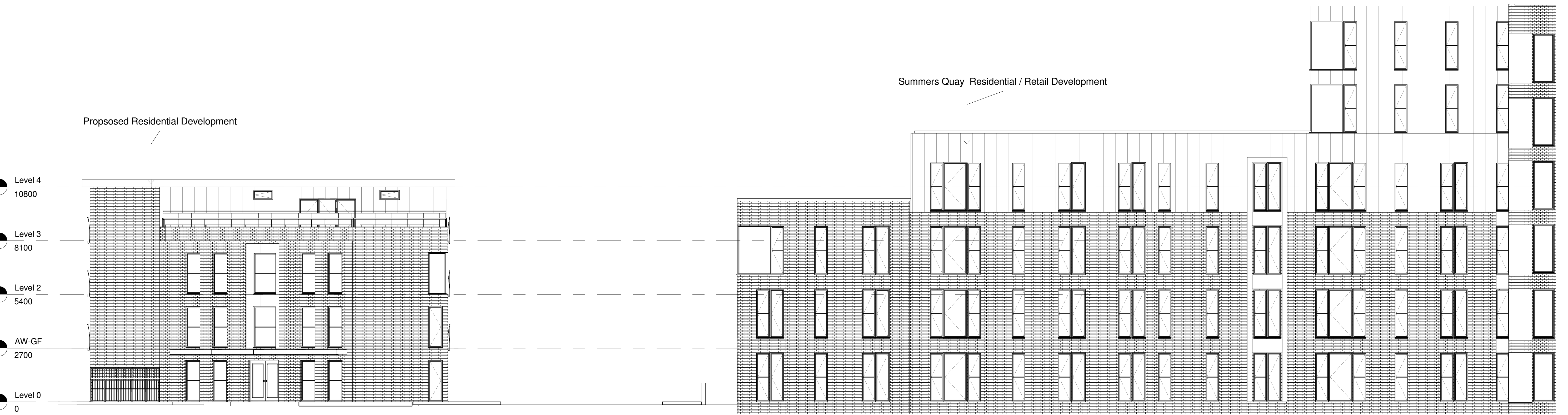
1 West Elevation - Extended 1 : 100